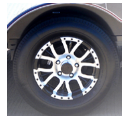
TWO TONE ALUMINUM