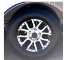
TWO TONE ALUMINUM