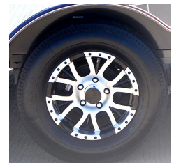
TWO TONE ALUMINUM