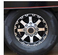
TWO TONE ALUMINUM