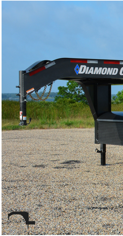
GOOSENECK PACKAGE AVAILABLE ON LPX, DEC, DET AND HDT