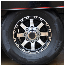
TWO TONE ALUMINUM