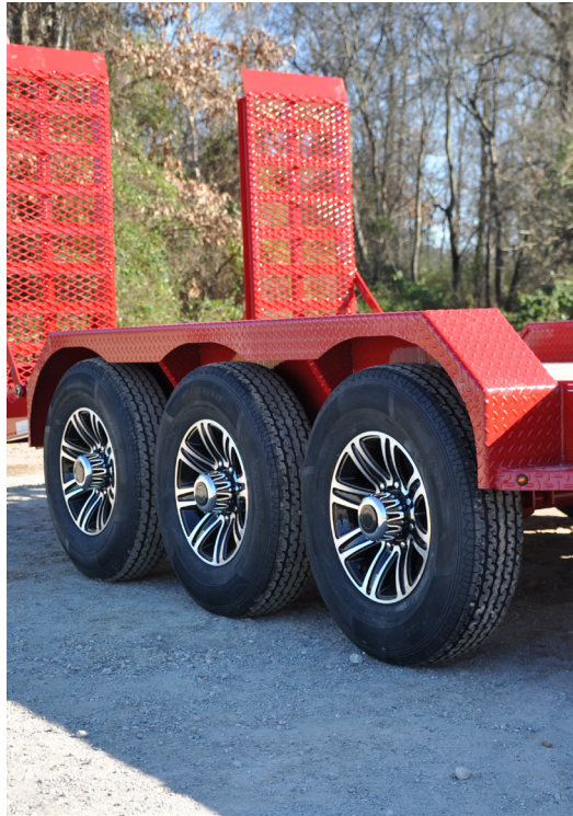
24,000 GVWR PACKAGE w/ ALUMINUM WHEELS & 3/16" SUPER HD FENDERS