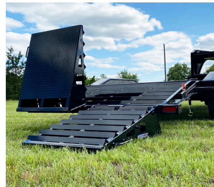
MAX RAMPS (AVAILABLE ON MODEL LPX)