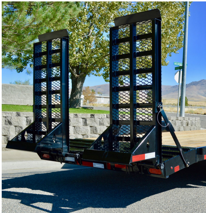
24" WIDE HD FLIP-KNEE RAMPS