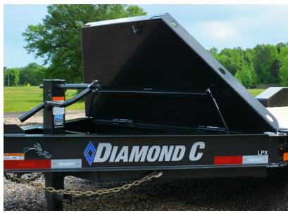
HD V-TONGUE LID