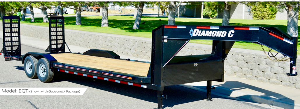
Model: EQT (Shown with Gooseneck Package)

Our mission is to ensure that each of our trailers are exceptionally durable, beautiful, and enduring.