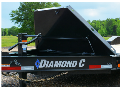
HD V-TONGUE LID

We stand behind our product. Diamond C Trailers come with a 3 year structure warranty.