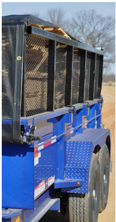
24" SIDE EXTENSIONS