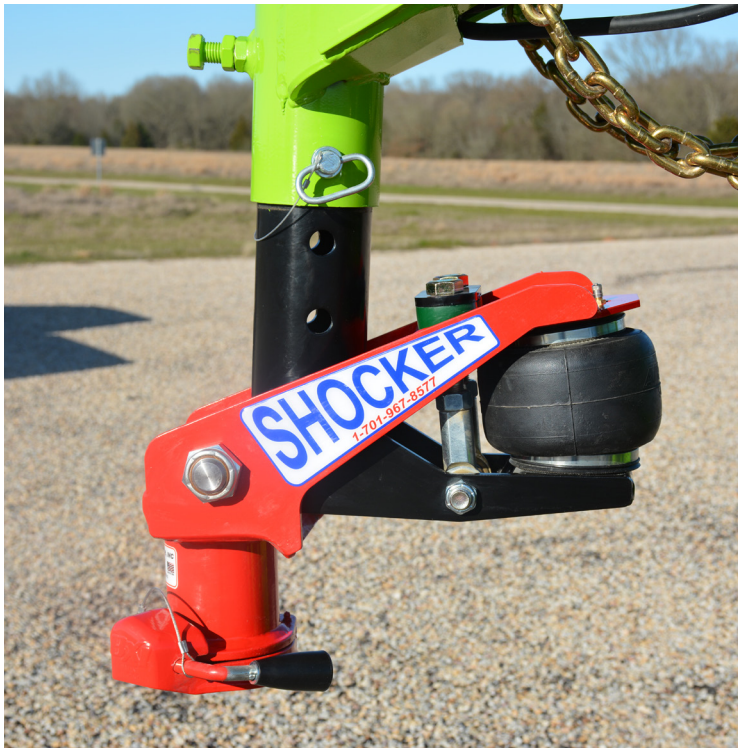
SHOCKER HITCH COUPLER