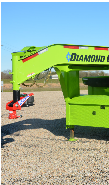
GOOSENECK PACKAGE (AVAILABLE ON LPD, LPT, & DOD)