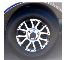
TWO TONE ALUMINUM